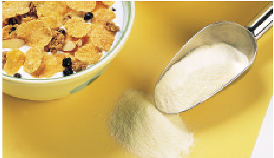
Whey supplementation has been shown to provide a significant decrease in body fat.

Low glutathione levels within various cells in the body forecast muscle loss, whereas adequate glutathione concentrations underline favorable changes in body