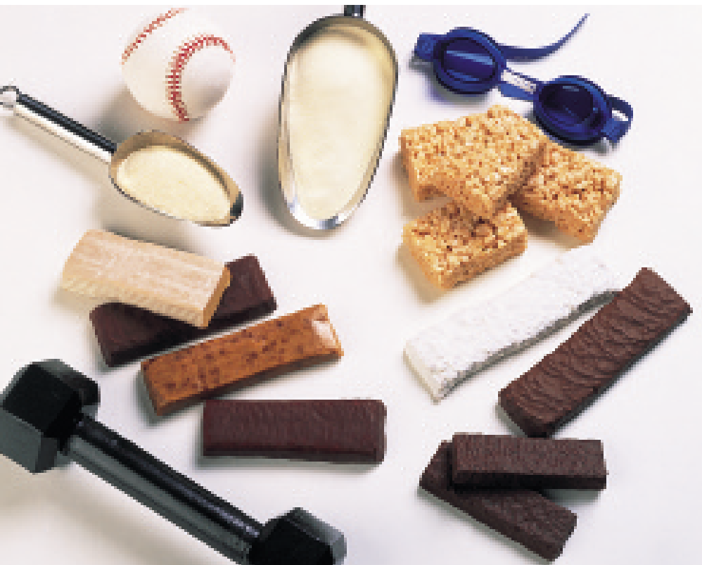
Whey proteins are particularly effective at stimulating muscle protein synthesis and promote better results from training.

In this study, four groups of resistance-trained men (20 to 35 years old) were given either whey isolate, carbohydrate, creatine or a combination of creatine and whey supplement (1.5 grams of protein/kg body weight/day). Preliminary results indicate that the whey-supplemented groups experienced double the gain in fat-free mass after 11 weeks of resistance training compared to males given the carbohydrate supplement. The ability of whey to enhance muscle gains during resistance training was confirmed at the cellular level. Muscle biopsies taken from the men before and after training revealed that whey supplementation increased the size of some muscle fiber types by up to 543% compared to carbohydrate supplementation. Additionally, the greater muscle hypertrophy response from whey supplementation correlated strongly with the superior strength improvements seen in the whey supplemented groups. 33 As the researchers noted, all groups started the training program equal in strength, and they consumed an adequate protein intake aside from supplementation. These studies suggest that whey may be a catalyst that ensures better results from resistance training.